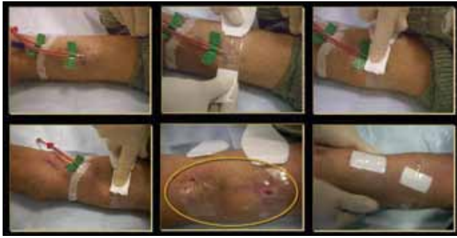
Fig. 2 - Successive steps of IRIS® use.

the time, firstly the venous and secondly the arterial needle. It is usually recommended to wait at least 10 minutes until after the venous needle site has clotted before removing the arterial needle. The best hemostasis is achieved by applying mild, digital (using two fingers), localized, direct pressure over the needle site (9). IRIS® and conventional bandage were removed as usual, several hours after the end of the hemodialysis session. The patients did not compress themselves. The nurses performed all the compressions. Cannulation complications with excess bleeding time related to a vascular breach were noted when IRIS® bandage or regular gauze was used.